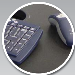
RACK MOUNTED FULLY-INTEGRATED COMPUTER WITH WIRELESS KEYBOARD AND MOUSE